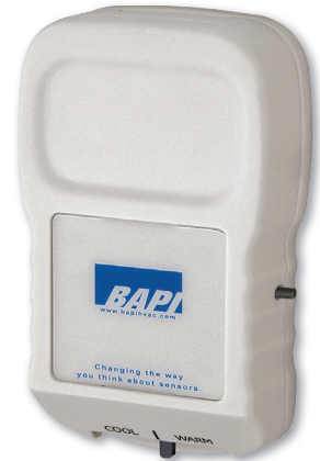
Transmitter with optional Temperature Setpoint & Override

The unit has an estimated battery life of 8 years using two high-capacity 3.6V lithium batteries with a transmit rate of once every 10 seconds. Each transmitter has a unique address with built in error detection. Each variable sent by the transmitter is picked up by the receiver and converted by a BAPI Analog Output Module to a voltage, current or resistance signal for the controller.