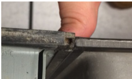
High Pressure Laminate Thickness 1/8 inch (left) vs. 1/16 inch (right)