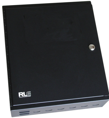
Relay Replicator 10x20 and 20x40