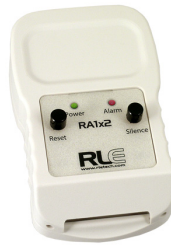
Relay Splitter and Alarm Annunciator (RA1x2)